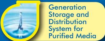
WFI - Buffer storage and distribution skid for a small plant

Generation Storage and Distribution System for Purified Media